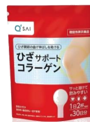
Food with functional claims "Knee Support Collagen"