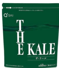
Kale Aojiru juice using Japanese grown kale "The Kale"