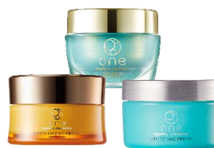
Euglena cosmetics "one"