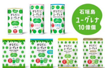
Euglena food "Euglena for the body"

Euglena Co. is a venture company originating from the University of Tokyo that sells health foods and cosmetics using the microalgae Euglena , and was the first company in the world to succeed in the outdoor mass cultivation of Euglena for food usage. It also conducts research and development on biofuels and feed. Since listing on the First Section of the Tokyo Stock Exchange in 2014, it has achieved rapid growth centered on the mail-order business for health foods and cosmetics, while also promoting businesses in the sustainability area, such as biofuel R&D and demonstration manufacturing and support for Bangladesh. In August 2020, the 15th anniversary of the Company's founding, it revamped the Corporate Identity (CI) and established "Sustainability First" as the Euglena Philosophy. For more information, see https://www.euglena.jp/ website.